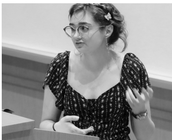
Annual Poetry Reading April 24 7 p.m. in HS 100