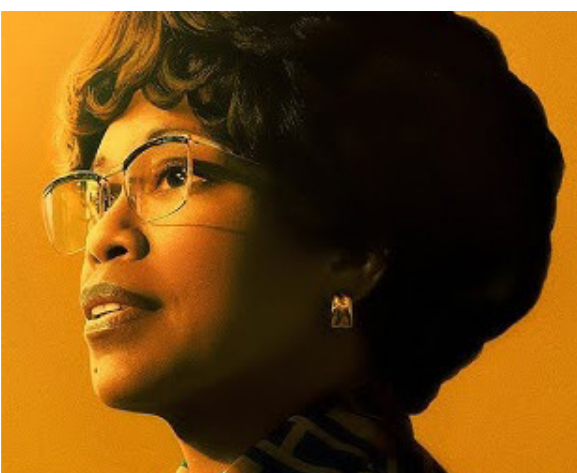
Film: “Shirley” February 6 6 p.m. in HH 286