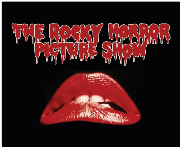
Film: “Rocky Horror Picture Show” With Flustered Mustard Live October 24 • 6 p.m.