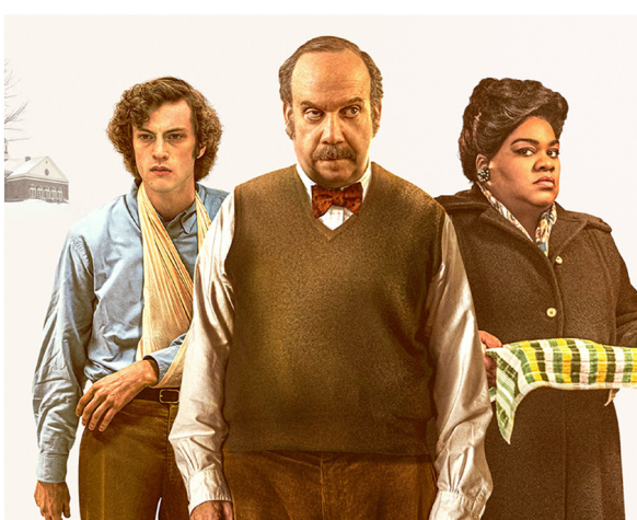
Film: “The Holdovers” December 10 6 p.m. in HH 286