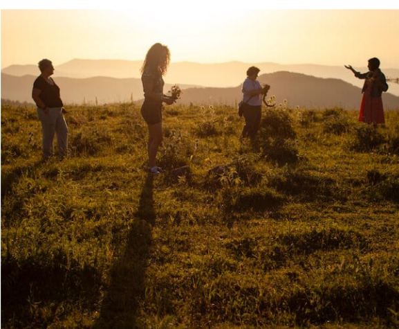
Documentary: “There Was, There Was Not” November 20 • 6 p.m.