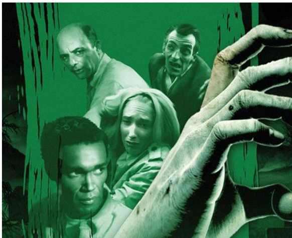
Film: “Night of the Living Dead” October 8 6 p.m. in HH 286