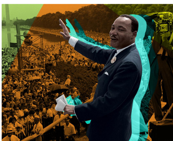
Annual MLK Celebration January 26 • 3 p.m.