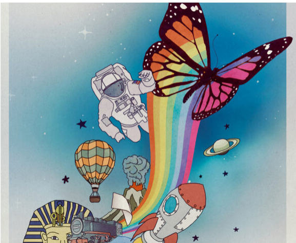
Documentary: “Butterfly in the Sky” September 12 • 6 p.m.